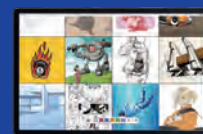
[Save] Wacom Shelf