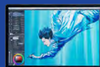
[Final drawing] CLIP STUDIO PAINT